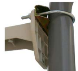
Pole - Mount Detail